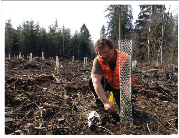
Figure 3. The author installing a Vexar tube around a WRC seedling with two cable ties fixed to a bamboo stick. Tree Fever research plantation, March 2015.

“ankylin”). In fact, many plants naturally contain potent TRP agonists, 12 which are a part of plants’ intrinsic defenses against herbivores. It is tempting to speculate that the ability of plants to produce TRP agonists can be harnessed to develop genetically modified browsing-resistant plants. Such browsing-resistant varieties of WRC are apparently under development, but no genetically-resistant seedlings are available yet, at least not to small farmers.