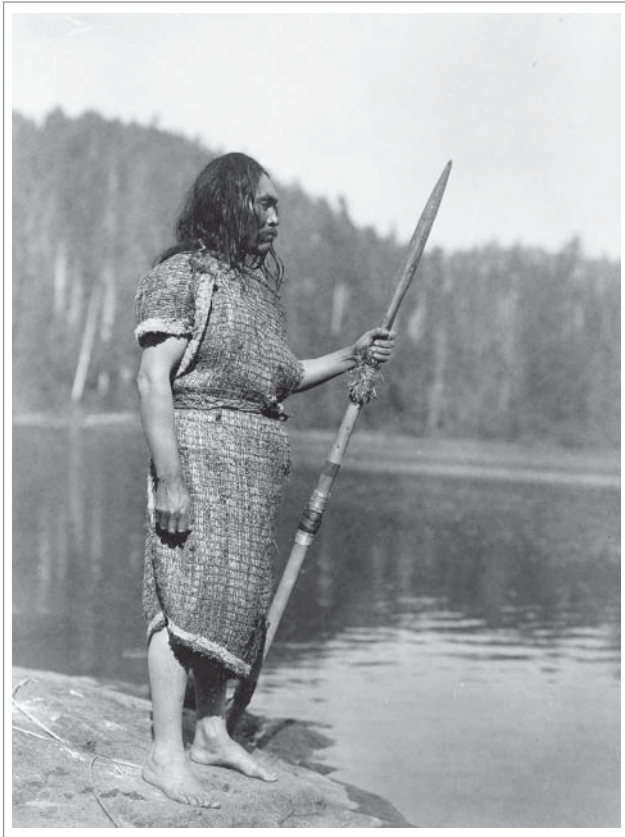
Figure 2. Nuu-chah-nulth (Nootka) tribesman, likely a whaler, wearing traditional cedar-bark clothes, Washington State, c. 1910.

seedlings at the time of planting. Most owners have a tube installed by weaving a small bamboo stick through the tube's wall and pressing it into the ground. There seems to be consensus, however, that this method provides little protection from elk. Using a larger stick and fixing a tube to the stick with two cable ties (Fig. 3) is recommended if elk migrate through your area.