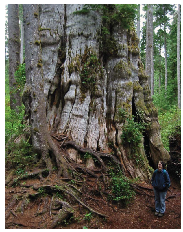
Figure 1. The so-called “Quinault-Lake Cedar.” This is the largest known WRC in the world, with a 19.5 ft (5.94 m) diameter at breast height and an estimated wood volume of 17650 ft 3 (500 m 3 ). 9 It is located ~50 mi (80 km) from Tree Fever.

Among individual protective devices, rigid mesh (“Vexar”) tubes are most common. The tubes are installed around