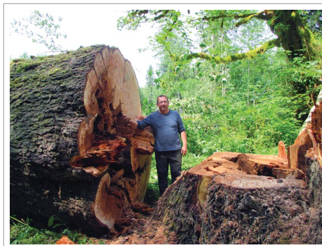
Figure 5. This rotten Sitka spruce was removed from Tree Fever during the 2014 rehab harvest. The tree had an 8.9 ft (2.7 m) diameter at breast height.

In July of 2014, the old Sitka trees were removed from this strip of land (Fig. 5), and the thickets of vine maple and devil's clubs (Fig. 6A) were cleared. Then in March of 2015, the experimental planta-tion was established (Fig. 6B). 1800 WRC seedlings were planted without any protection, each marked with a red flag. Another 1500 WRC seedlings were