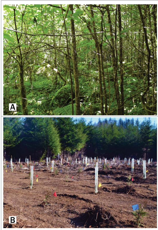
Figure 6. Before and after. Low-grade hardwoods in the narrow strip of land between the West Satsop RMZ and main Douglas fir stands before the rehab harvest (July 2014) (A). The thickest trunks in the front have a diameter of ~1.5 in (4 cm). After the harvest, site preparation, and planting, this strip of land became a WRC research plantation (March 2015) (B).

protected with Vexar tubes and marked with yellow flags (Fig. 3). And yet another 1800 WRC seedlings were co-planted with Sitka spruce seedlings and marked with blue flags (Fig. 4A). Similar to the WRC, Sitka is a shade-tolerant tree and it should do well on this plantation. These three modes of protection were intermixed (Figs. 3,6B). We will test quantitatively, on the same site, whether the co-planting method works, and whether it works better or worse than Vexar tubes under our conditions. Without quantitative data from studies like this one, it is just too risky for tree farmers to start WRC plantations that take a half a century to grow!